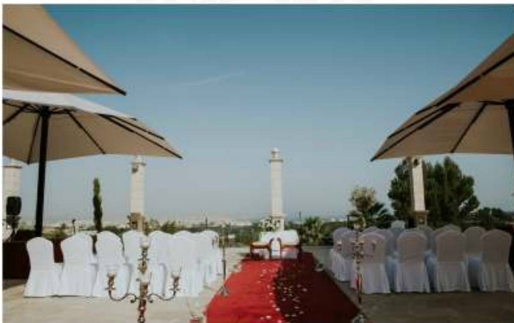
Main Terrace (ceremonial marquee renis not included in the price)

The set-up, fixed price for up to 100 people